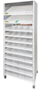
HD Stock™ Drawers