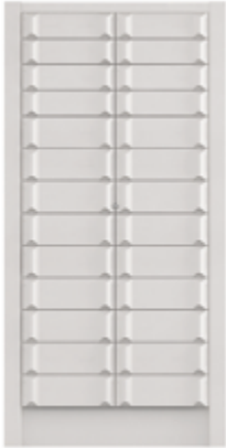
HD Stock™ Cabinet