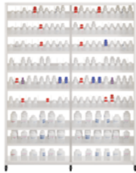
HD Stock™ Speed Shelving