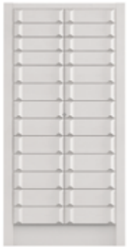
HD Stock™ Cabinet