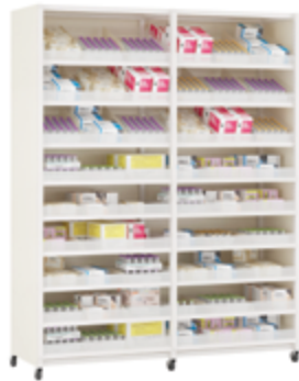
HD Stock™ Shelving