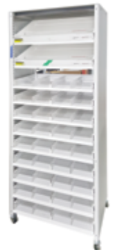
HD Stock™ Drawers