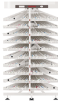
HD Stock™ Carousel