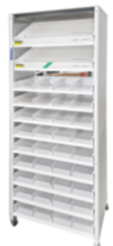
HD Stock™ Drawers