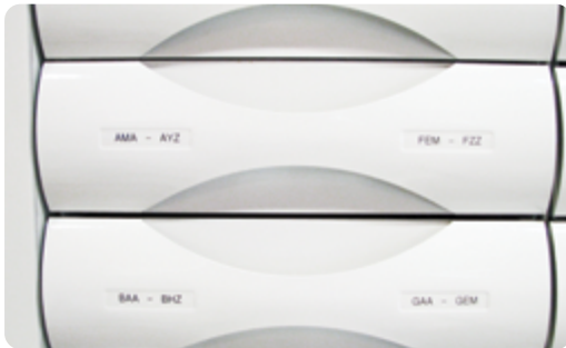
Drawers are organized alphabetically (Vision 2 drawer fronts shown)