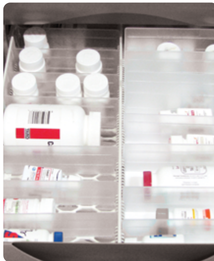
Can be divided to handle approximately 20 SKUs/ 65 items per drawers