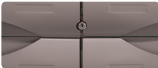
Lockable drawers protect stock that needs to be kept secure