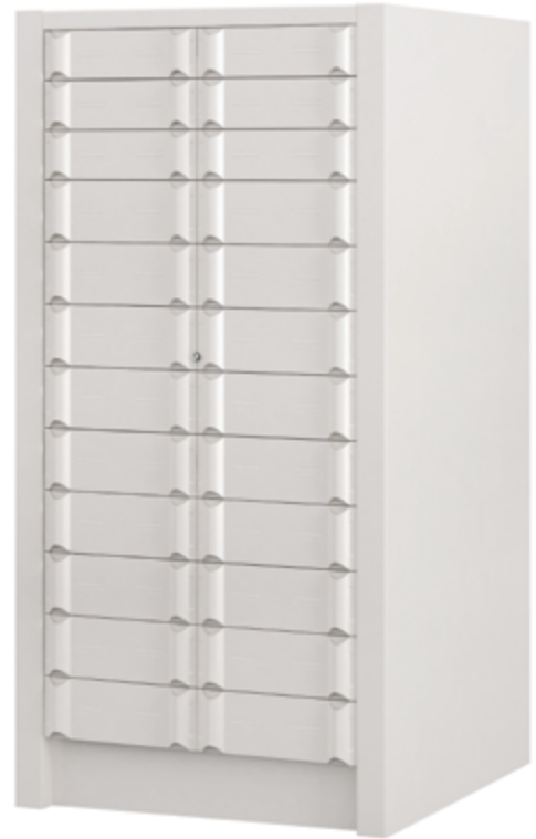
Vision 1 drawer fronts shown