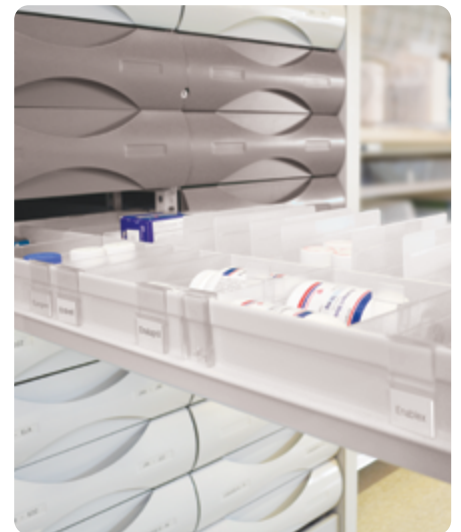
Clear clips/names for easy visual recognition