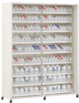
HD Stock™ Speed Shelving