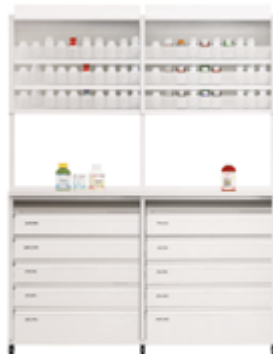
HD Stock™ Workstations