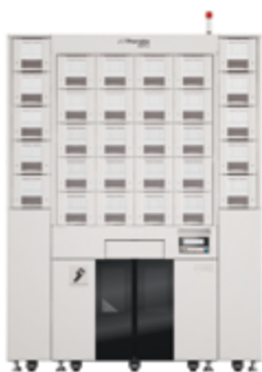
ATP® 2 Series