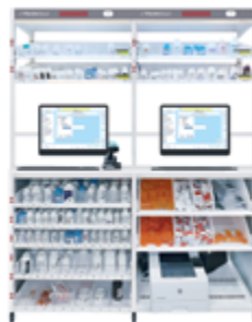
Beacon® 2-Bay Workstation