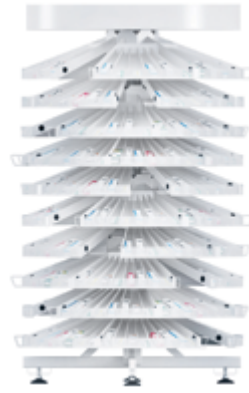
HD Stock™ Carousel