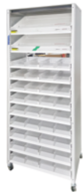
HD Stock™ Drawers