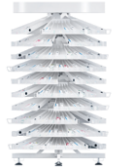
HD Stock™ Carousel