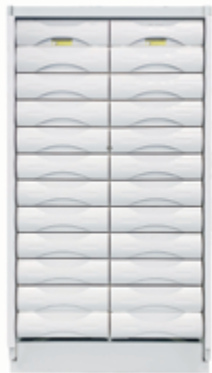
HD Stock™ Cabinet