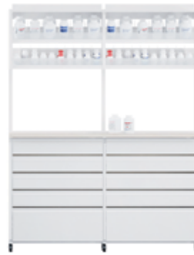
HD Stock™ Workstation