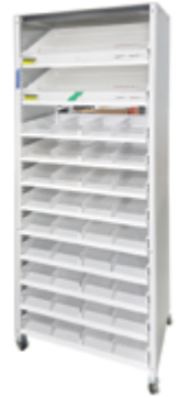
HD Stock™ Drawers