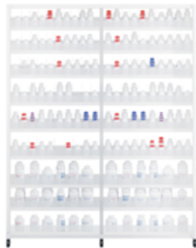
HD Stock™ Speed Shelving