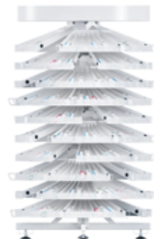
HD Stock™ Carousel