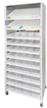
HD Stock™ Drawers