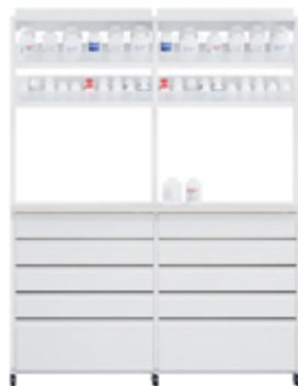
HD Stock™ Workstations