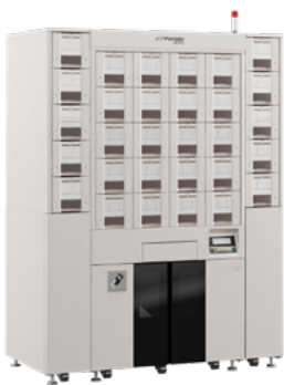
ATP® 2 Series