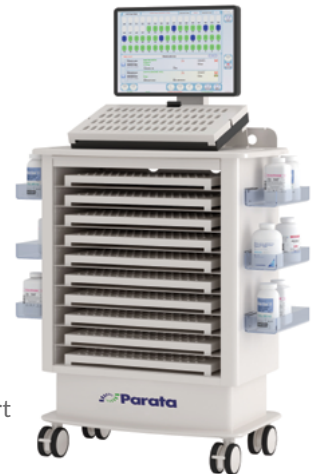
ULT with optional cart