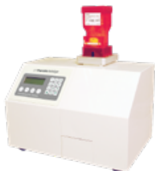
BullsEye® Tablet Splitter