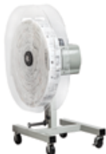
Automatic Spooler for ATP® Series