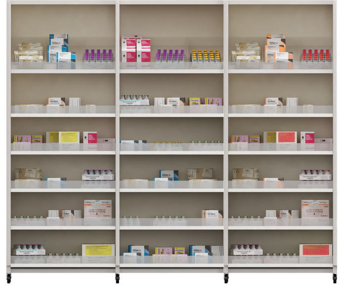
Available in 1-, 2-, and 3-bay configurations

Depending on the fixed shelf selection, shelf load capacity is up to 55 pounds.