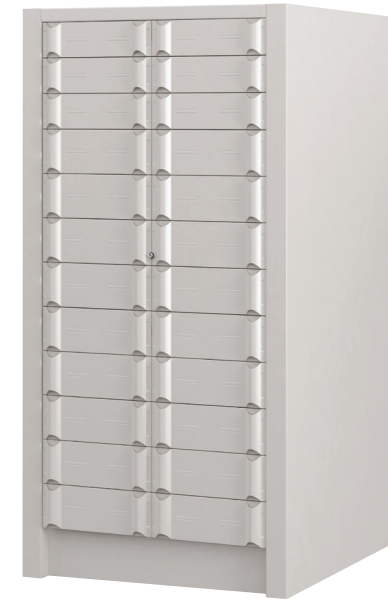
Vision 1 drawer front option (above)

Steel mesh drawer bottoms reduces pill dust falls to the floor, reducing irritants and contamination. Withstands bleach or H<sub>2</sub>O<sub>2</sub> cleaning.