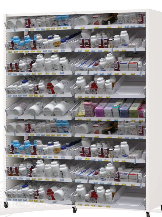
Available in 2- & 3-bay configurations

The Speed Shelf pulls down to for stocking from the back; facilitating First-In – First-Out inventory management.