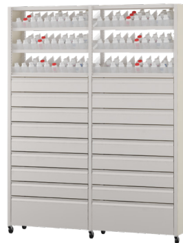
HDStock™ High Profile