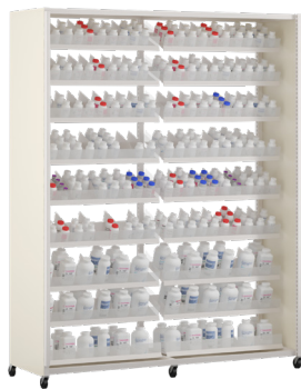
HDStock™ Speed Shelving